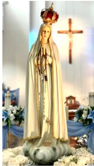
Our Lady of Fatima