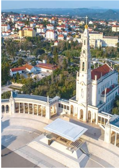
Fatima, the Portuguese city of miracles