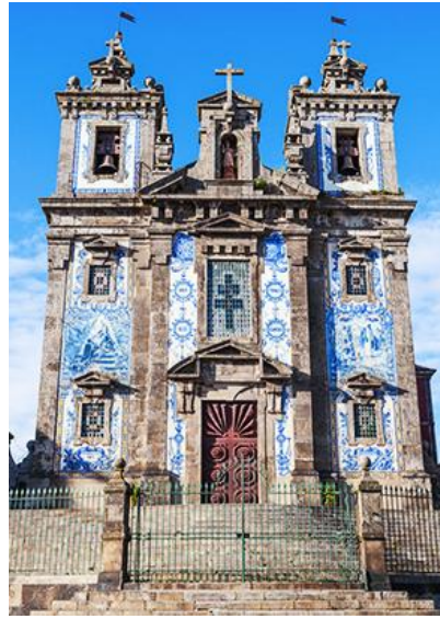
Santo Ildefonso Church (Porto)