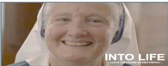
Summoned to Life: Spiritual Foundations, Sisters of Life

As we continue to answer our Montana Bishops' call to defend life, we ask Christ to grant a conversion of hearts so that our brothers and sisters would recognize and respect the infinite dignity of each human life and reject the radical abortion initiative CI-128. We also ask that our own hearts be transformed so that we may share the truth of the sanctity of life with wisdom and charity. To that end, please view and share the videos below. May they bless us and all who watch them. Both videos are found at the link and QR code below.