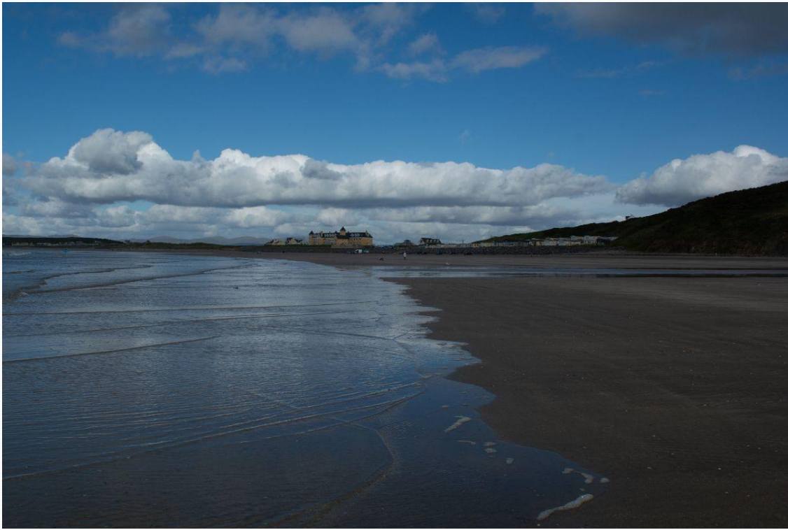
The beautiful ocean on a mild day!