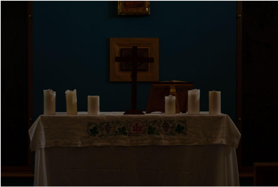
The tabernacle and altar in our chapel at Rossnowlagh.