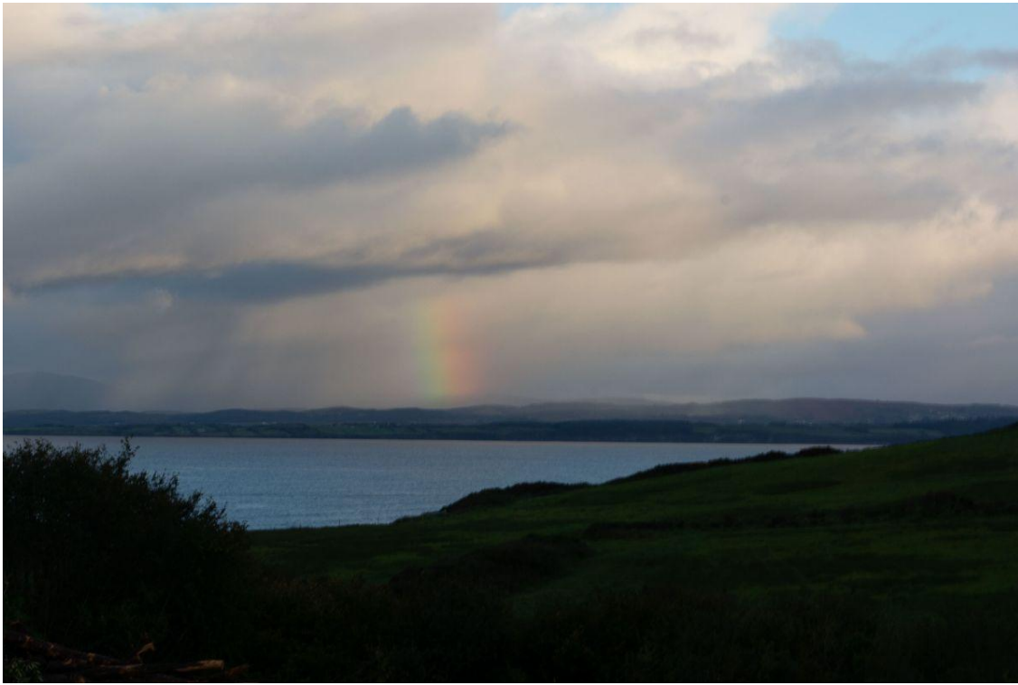
A picture my friend took of a rainbow over the ocean in County Donegal. This place is about a ten minute walk from our training center. As you can see, the views here are quite spectacular!